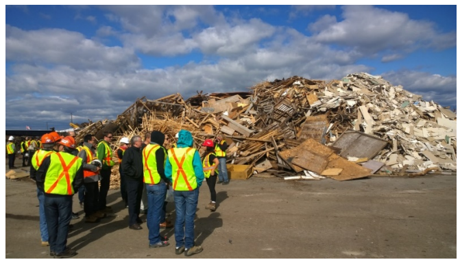
Construction and demolition waste after a rough sort, before milling and screening October 2014

On the following page, a short timeline of the Low Carbon Fuels project to date is provided.